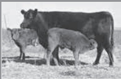
Black red carrier Angus cows produce red calves.