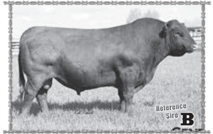
WFL Merlin 018A Sire of Lot 1