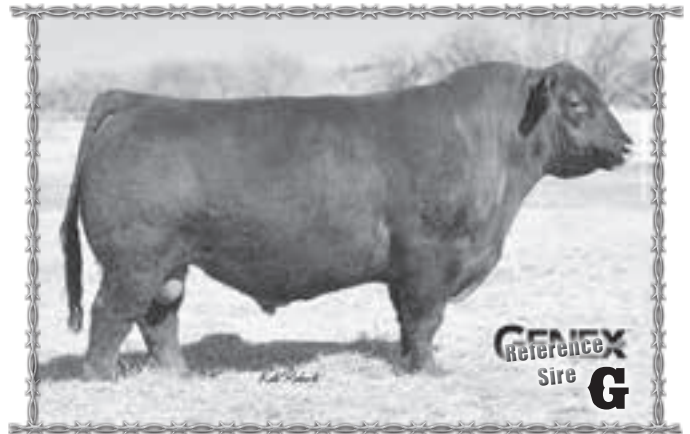
Reference Sire G