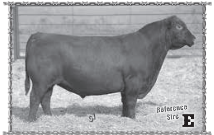
Reference Sire E