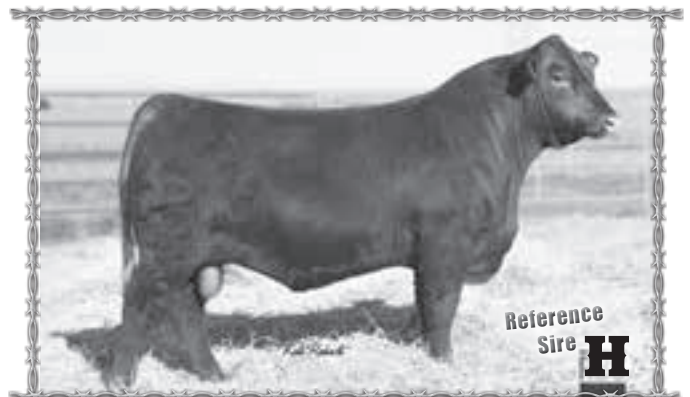
Reference Sire H