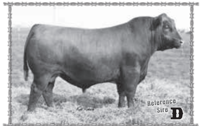
Reference Sire D