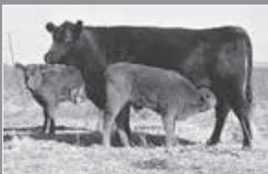
Black red carrier Angus cows produce red calves.