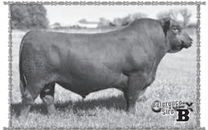
Reference Sire B