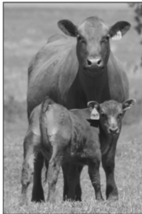
Independent research studying five years of Superior Livestock Auction data confirms the value of Red Angus replacement females.

Over the years, stockmen have voted with their checkbooks, purchasing heifers they know will bring profitability to their ranching businesses – and Red Angus females are their most-favored choice. ■