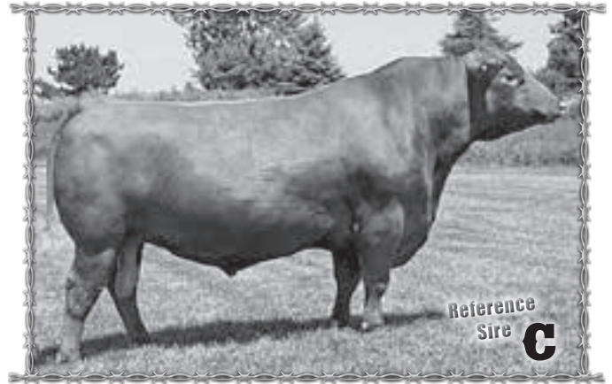
Reference Sire C