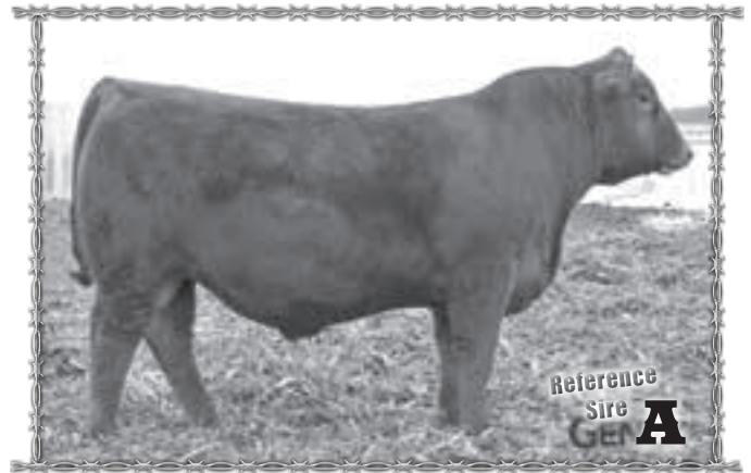
Reference Sire A