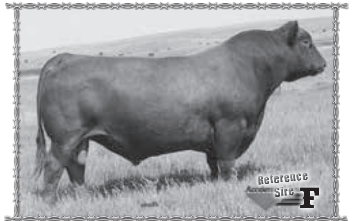
Reference Sire F